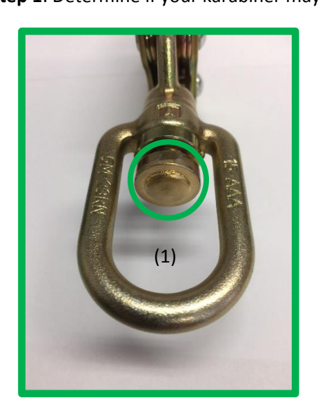
Step 1 : Determine if your karabiner may be affected.